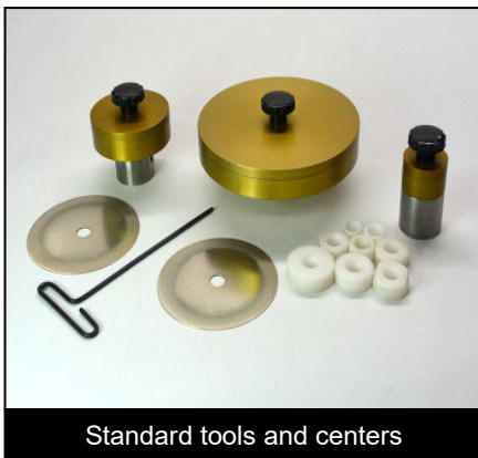
Standard tools and centers

Now You Can Sharpen More, Remove Less ... And Do it Faster!