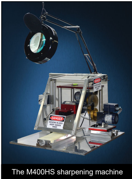
The M400HS sharpening machine