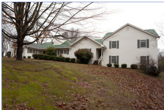
Original R&D compound in 1969

AFTER 50 YEARS IN THE POULTRY BUSINESS, HILL PARTS COMMITMENT TO CUSTOMER SERVICE AND QUALITY PRODUCTS HASN'T WAVERED