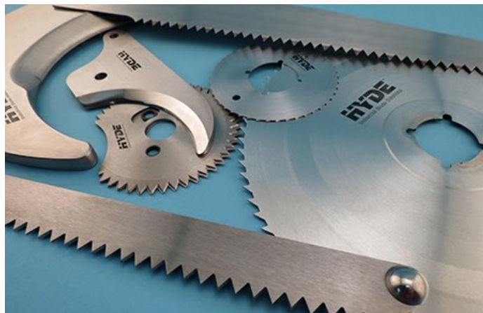
New Hyde IBS Beef & Pork Processing Blades.