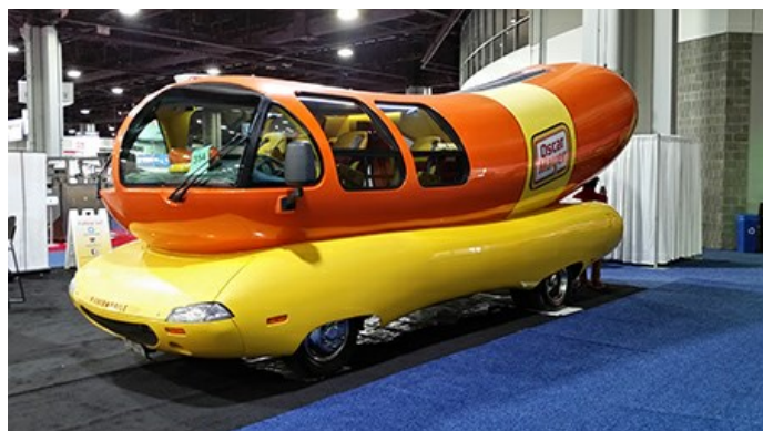
"A special appearance by the Oscar Meyer Wienermobile at IPPE"

For more info: http://www.industrialbladesandknives.com/wp-content/uploads/2015/09/beef-pork-blades.pdf