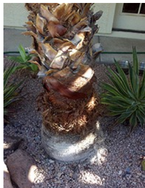
Skinning the fronds off palm trees is one of the more interesting uses for Hyde IBS blades.

We hope you'll find something of interest to you and your business in this issue of The Cutting Edge. We'd like your feedback on what you would find helpful in upcoming issues. E-mail us at info@hydeblades.com