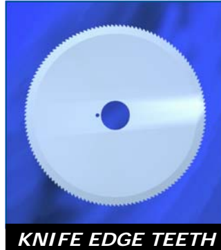
KNIFE EDGE TEETH